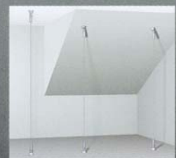
Application on slanting walls